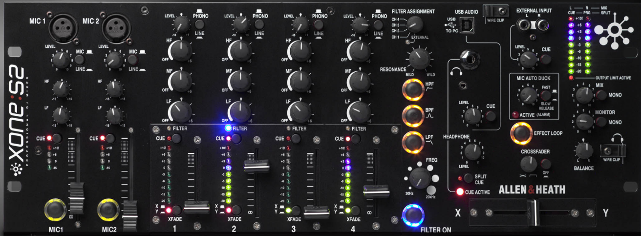
Rotary channel fader model also available

Xone:S2 is a new analogue installation DJ mixer for use in clubs and bars, and by professional mobile DJ's. It's a 19" rackmount 4U mixer featuring 4 stereo dual-input channels, 2 mono mic/stereo line channels, with a choice of linear or rotary VCA channel faders, along with the legendary Xone analogue filter and a host of other functions.