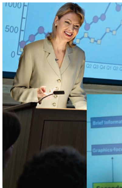
R300 in action with optional ULM18 lapel microphone (left) and HM3 headworn microphone (below)