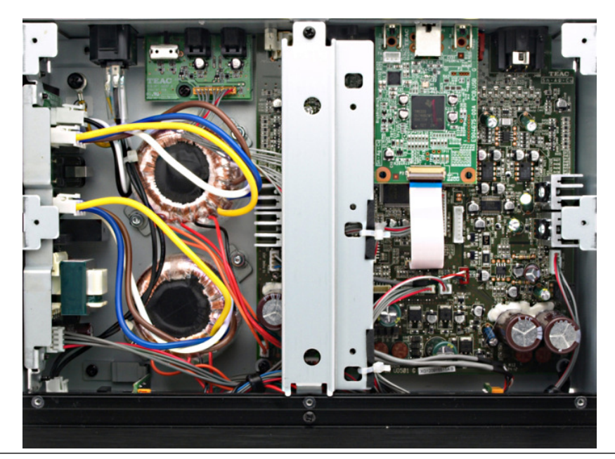
This document contains pre-release information which should not be released to the public before the "launch date". Specifications and contents are subject to change without notice. Please check the TEAC website or TCJ Sales Department for the latest information, before you publish the information to the public.

Max 13W (Auto power save standby mode: 0.1W) Operating Temerature: +5°C to +35°C +41°F to +95°F 5% to 85% (no condensation) -20°C to +55°C -4°F to +131°C 290 (W) x 81.2 (H) x 244 (D) mm, 11.4" (W) x 3.2" (H) x 9.6" (D) 4.0kg, 8.8 lbs. AC Cable, AC Plug Adapter (3P-2P), Stereo RCA Cable Owner's Manual, Warranty Card